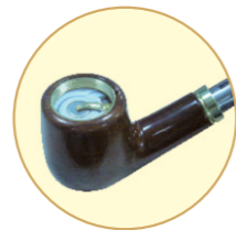
Board positive plate