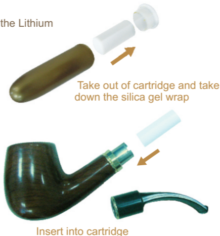
Insert into cartridge