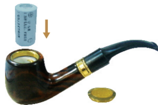
Insert into battery

Unwrap the atomizing electronic alkaloid liquid container, Pull out the inhaler of the pipe, put in the liquid storage container with open-side first in and insert the inhaler, the product will be available for smoking.