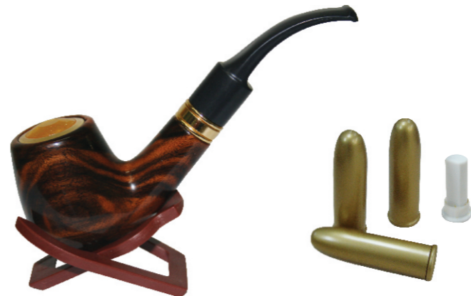
Pipe And Bracket